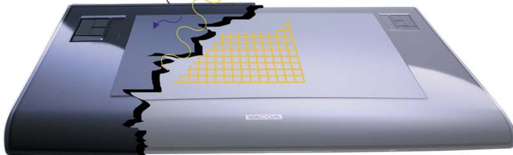
Tablet sends and receives

A simple analogy for this patented technology is that of a piano tuner using a tuning fork to tune a piano. As the tuning fork is brought into proximity of the appropriate vibrating piano string (if the fork is of the same frequency) it will begin to borrow energy from the vibrating string and resonate, generating a tone. In much the same way, as the Wacom pen comes close to the tablet surface, it begins to resonate, generating its own frequency back to the tablet. When it hears the pen, it tracks the pen's location with unprecedented accuracy. The tablet then sends location, pressure and tilt information to the computer along with a signal indicating whether the pen point or the eraser is being used.